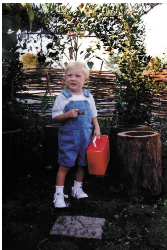
"First Day of Pre-School"