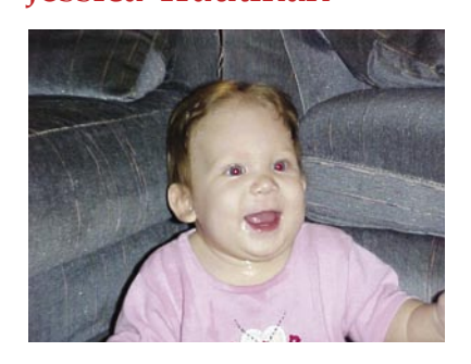
"Our little noodlehead is now at peace" April 26, 2002 to July 4, 2004 Virginia Beach Virginia