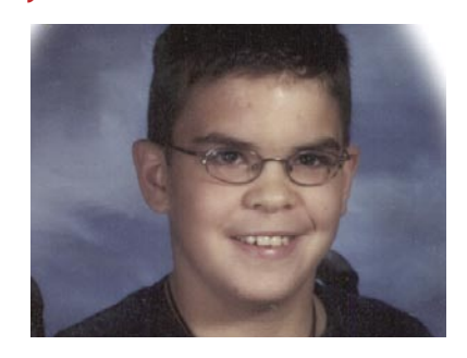
"Our Angel In Heaven" May 25, 1990 to August 11, 2004 Winnipeg Manitoba Canada